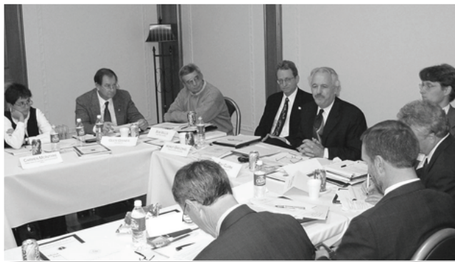
Southern Regional NEPA Roundtable discussion on the NEPA Task Force report Modernizing NEPA Implementation