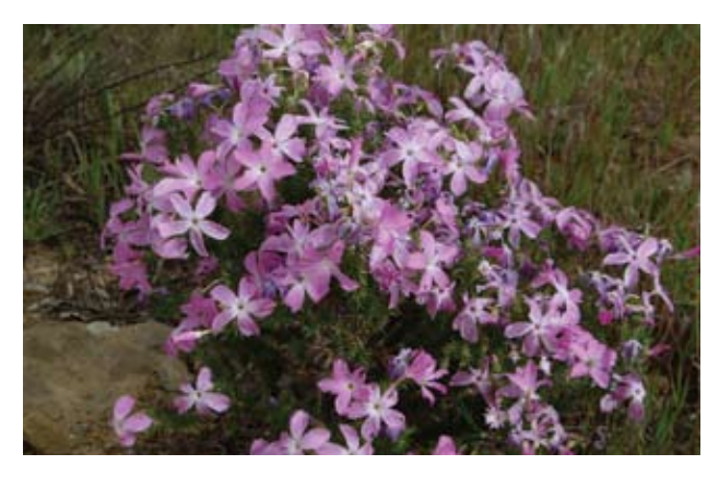
A prickly phlox ( Lepodactylon californicus ) was in full bloom in Area IV on March 12 near the location of the former Sodium Reactor Experiment facility.

more complete understanding of SSFL Area IV work processes and activities so that characterization of Area IV can be adequately accomplished. This information will be provided to EPA as it plans and completes its survey.